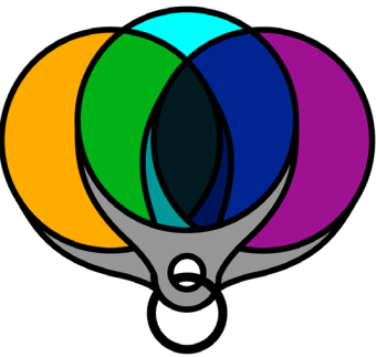
A selection of three to guide us...